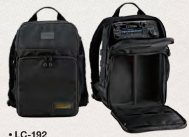
• LC-192 Multi-function backpack

Visit our website for more details on the LC-192