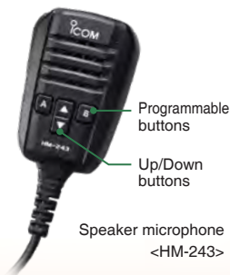
Speaker microphone <HM-243>

Enjoy the latest DV mode features with the IC-705. Have direct access to the D-STAR network with Terminal/Access point modes. Additionally, the IC-705 has the Photo Share feature introduced with the IC-9700. Share photos, without the need of a computer with other users.