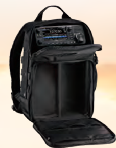
LC-192 Multi-function backpack

Enjoy portable operations with the supplied HM-243, programmable speaker microphone. Perfect for operation with the IC-705 safely secured in the optional LC-192 backpack. User assignable buttons put functions like frequency and volume adjustments at the tip of your fingers, without removing your backpack.