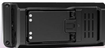
BP-272 attached (Rear panel view)

Utilizing the high capacity Li-ion battery from the ID-51A and ID-31A handheld radios. A 13.8 V DC external power supply can be used for operation and charging of the BP-272.