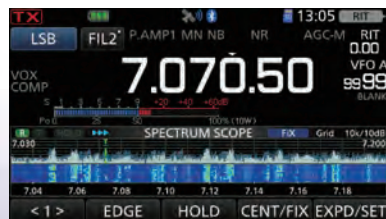
Display example of real-time spectrum scope and waterfall

Performance seen with the IC-7300 and IC-9700 spectrum scope is at the tip of your fingers for field operation. You can quickly see band activity as well as finding a clear frequency, all in the compact radio and not as an expensive add-on.