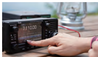
Touch screen display

The large 4.3" color TFT touch LCD, same size as the IC-7300 and IC-9700, offers intuitive operation of functions, settings, and various operational visual aids, such as the band scope, waterfall, and audio scope functions.