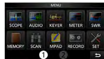
Menu screen example