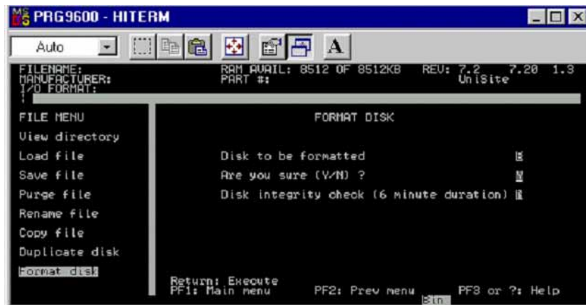
FORMAT DISK screen